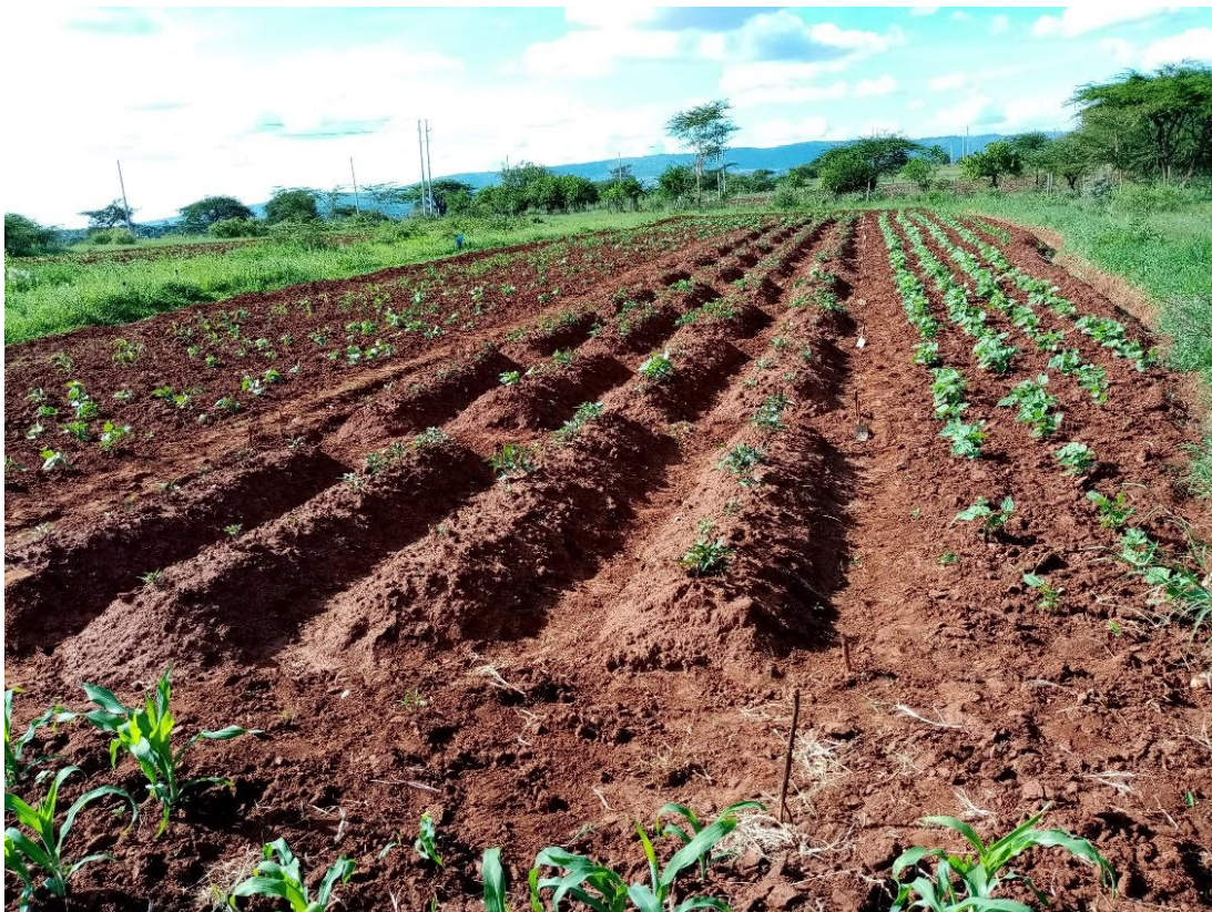
Figure 2. Experimental layout and treatments.