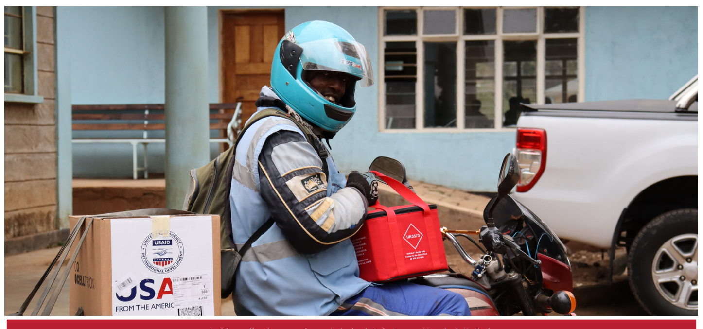
A rider collecting samples at Loitoktok Sub-County Hospital, Kajiado