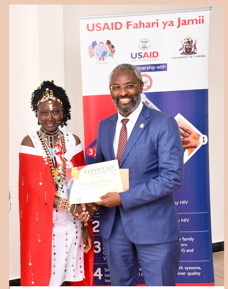
UON VC visit to Kajiado and awarding best performers