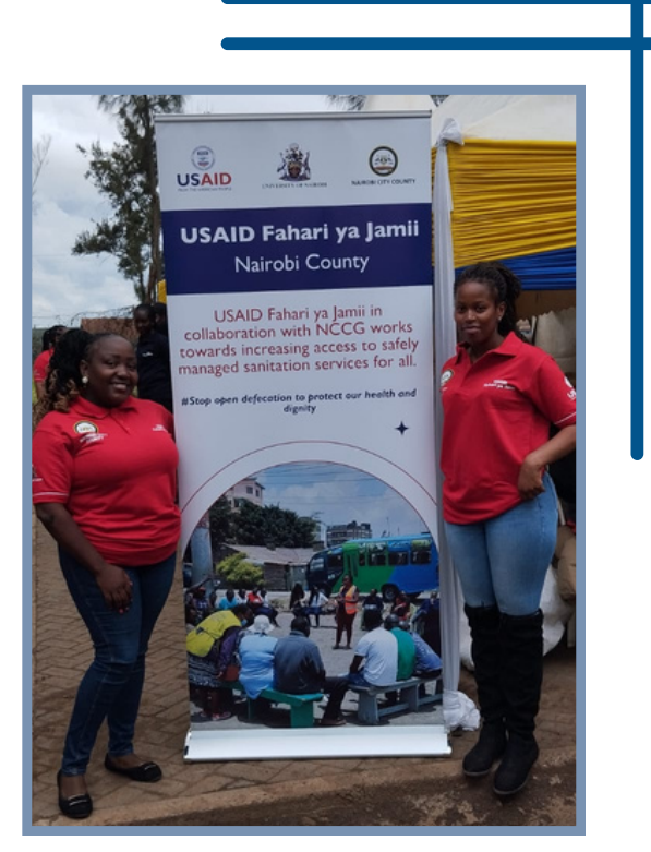
World Toilet Day Celebrations in Nairobi