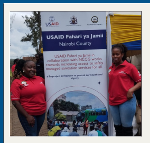
World Toilet Day