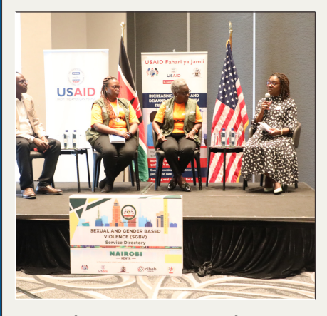
Development partners gender group meeting