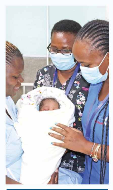
A mother celebrating safe delivery with nurses at Baba Dogo Health Centre