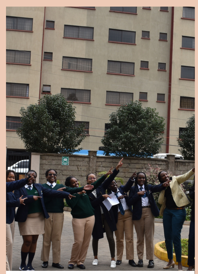
NOVA Pioneer girls job shadowing experience